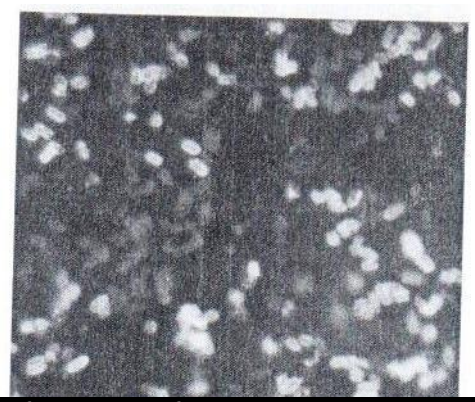
Figure 3 - Intestinal impression smear from a pig infected with enterotoxigenic Escherichia coli stained by indirect immunofluorescence with anti-fimbria antibodies and fluorescein-isothiocyanate-conjugated anti-immunoglobulin. Many fluorescing bacteria are present (x1200).

Figure 2 - Hematoxylin-eosin stained histologic section of small intestine from a pig infected with enterotoxigenic Escherichia coli. Bacteria form a confluent layer on the epithelial surface. (x400)