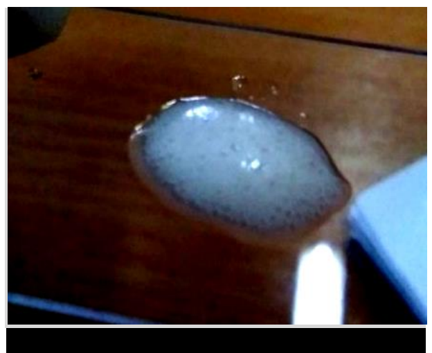
Figure 4 - Catalase test produces gas bubbles