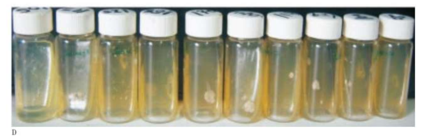
Figure 2 - The MICs of aqueous and n-butanol extracts of P. dodecandra against H. capsulatum var. farciminosum . A: MIC of aqueous extract: growth was observed starting at 0.625%; B: MIC of n-butanol extract: growth was observed starting from 0.039%; C: MIC of ketoconazole (standard): growth was observed at a concentration of 1.2×10<sup>-5</sup>%; D: Saline diluted Sabourauds dextrose agar (negative control): growth was observed in all agar plates (Mekonen et al., 2012).