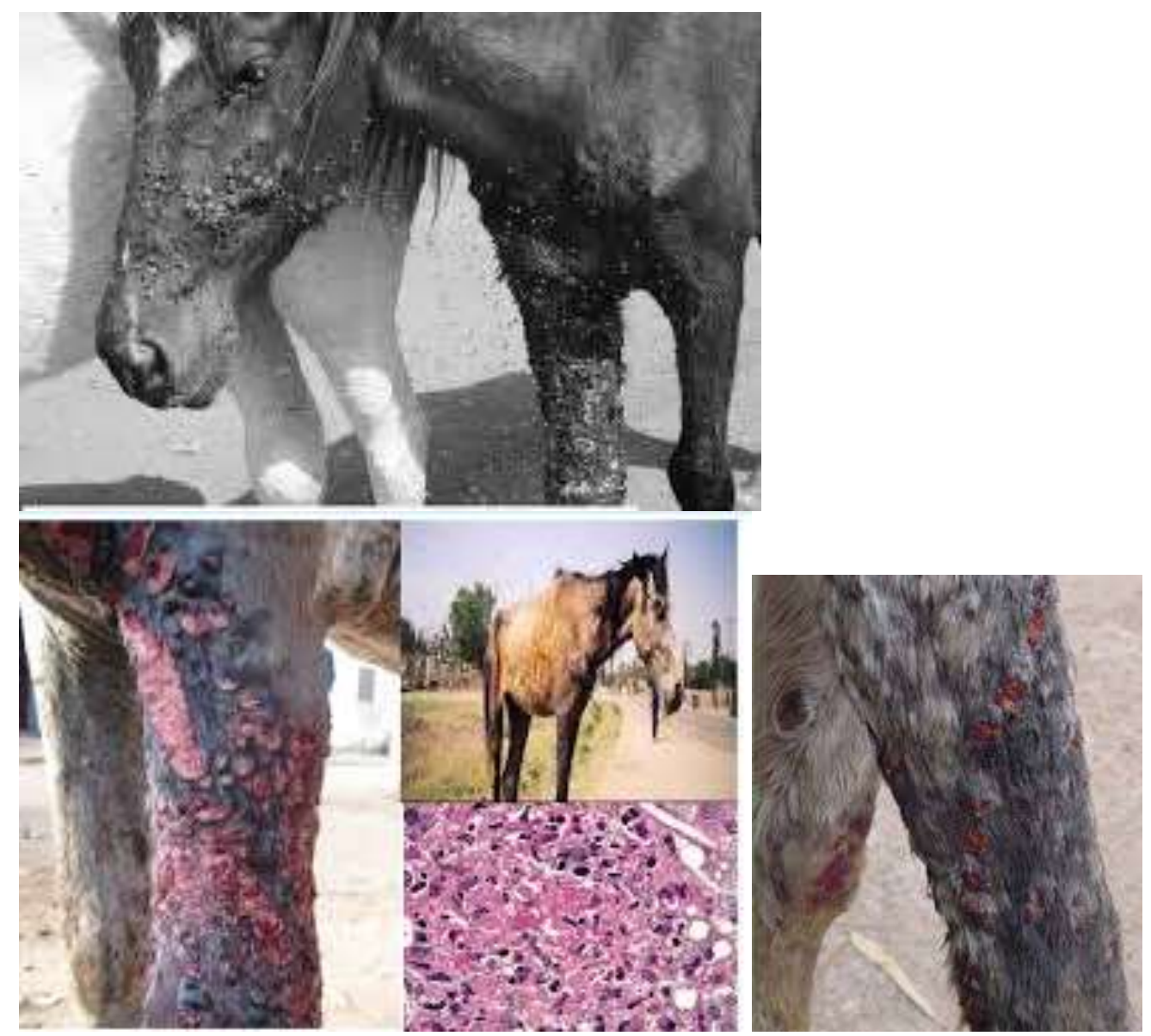
Figure 1 - Lesions of Epizootic lymphangitis (Wondmnew and Teshome, 2016).