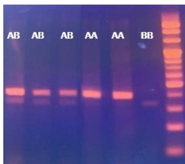
Figure 1 - LEP/Sau3AI genotypes in cattle

Dolmatova et al. (2020) indicated a clear tendency of an effect of the TG5 genotype on milk productivity in dairy cattle. Cows with the TG5 TT genotype had the highest milk yield and fat content in milk (Dolmatova et al., 2020), and had significantly higher lipid content in the loin muscle (Thaller et al., 2003) than the TG5 CT or TG5 CC genotypes. The TG5 TT genotype was the only genotype that showed differences in the distribution of marbling, increasing marbling in beef (Burrell et al., 2004).